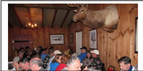
Cook's BBQ with Mustang Passion Club