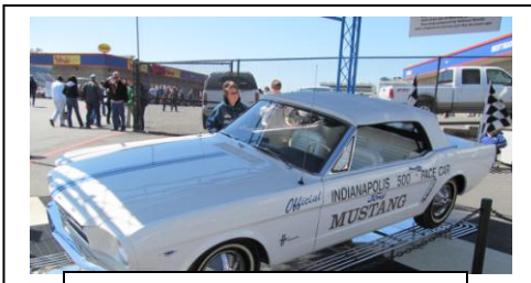
64 1/2 Pace Car on Display

Next Meeting: July 26th 4:00 at Hawg Wild in Clarkesville