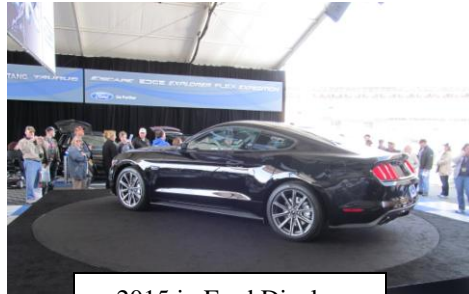
2015 in Ford Display