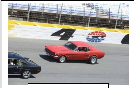
JJ's 65 on Parade Lap