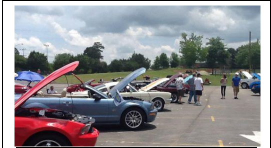
Club cars & show field at Calhoun