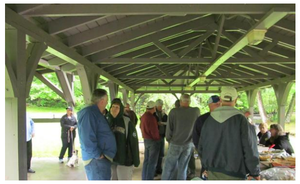
Great setup for a cookout & meeting

Our May meeting was held at Vogel State Park Shelter #1, around 40 members braved the rain and cold again for the cookout/potluck and then meeting.