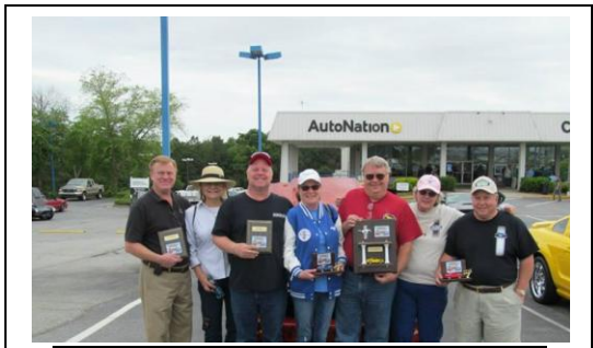
Winners at Tara's show in Union City