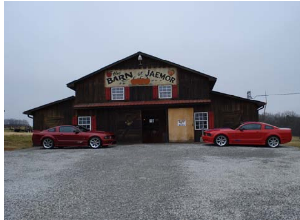
The Barn at Jaemor farms—The meeting place

would be someone who would arrange meet-ups at various shows and events for members who were able to attend. We will be taking additional nominations for all positions at the meeting