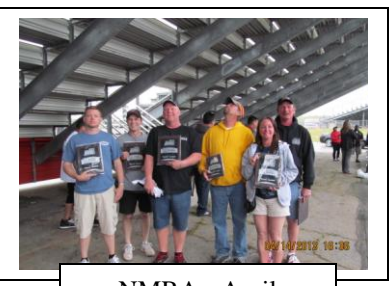
NMRA - April