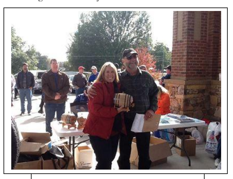
Saturdays Awards at the Moonshine Festival