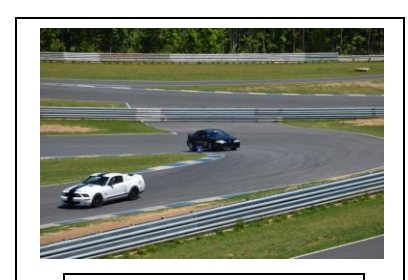
High Speed Fun - May