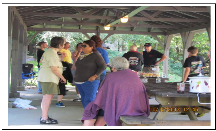
Good company; good food.

We had our October meeting at Vogel State Park. We ate hamburgers, hot dogs, and all kinds of other goodies, then had our meeting. After the meeting several of us took a pony run across Hwy 180 and the Richard Russell Scenic Highway, stopping for the views a couple of times before heading home. On the way to the meeting, we also ran the section of 180 between Suches and 129, which is a great drive, unless of course you're following a slow Harley.