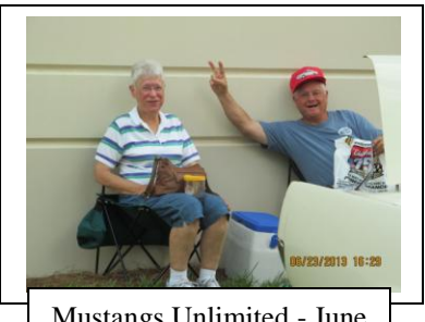
Mustangs Unlimited - June