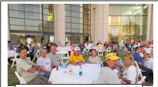
Low Country Boil Saturday Evening