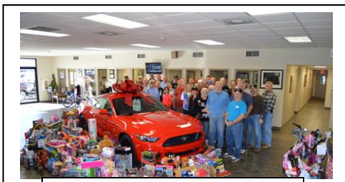
Dropoff at Jacky Jones Ford

Mustang Club of America Chartered Regional Club