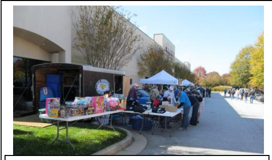
Toy haul from Toys for Tots Fall Roundup