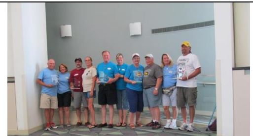
Members with awards

We had a great time checking out restaurants in the historic district and River Street, and attended the Low Country Boil Saturday evening, really convenient using the river taxi, to get between the show site and hotels and restaurants.