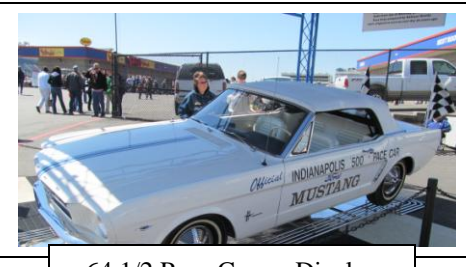
64 1/2 Pace Car on Display