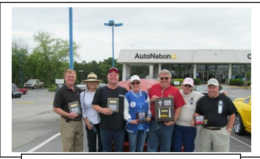
Winners at Tara's show in Union City