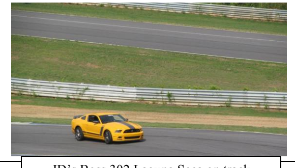
JD's Boss 302 Laguna Seca on track

Our May meeting was held at Vogel State Park Shelter #1, around 40 members braved the rain and cold again for the cookout/potluck and then meeting.