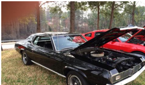
One of 3 Cougars in Attendance