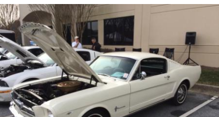
Many Gen 1 Cars were on the Show Field