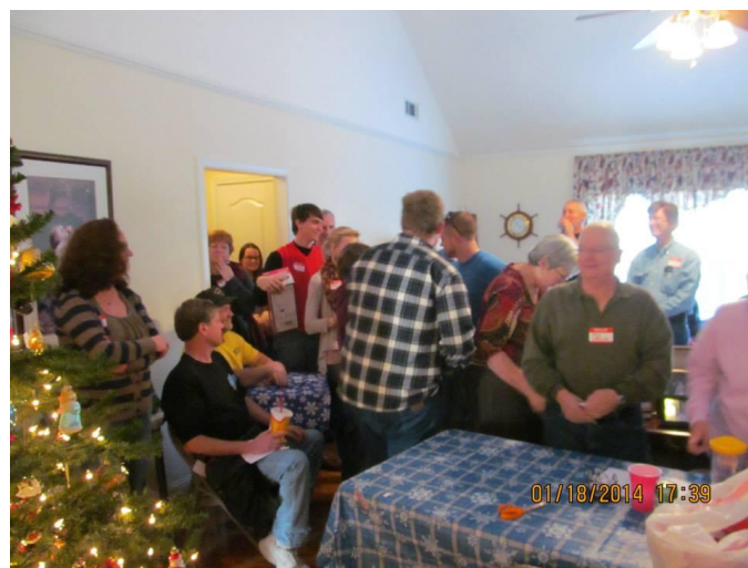
J.J. looking to appropriate the perfect gift