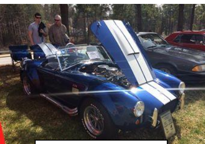
Best of Show