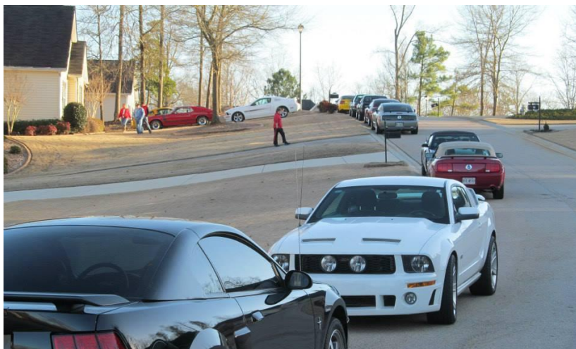
Filled the cul de sac with Mustangs