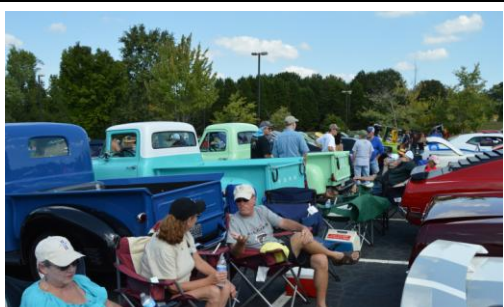
Part of the crew enjoying the Braselton Bash