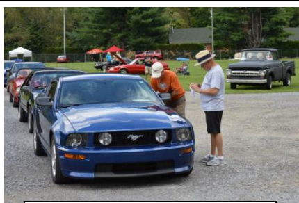
Rally Line Up Leaving Out