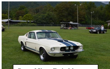
Best of Show Early Mustang