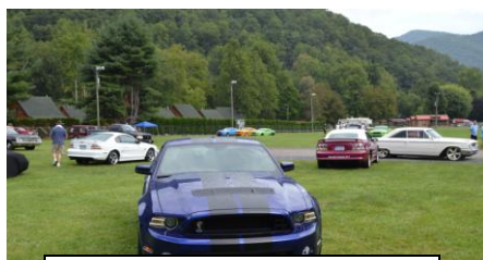
Best of Show Late Mustang