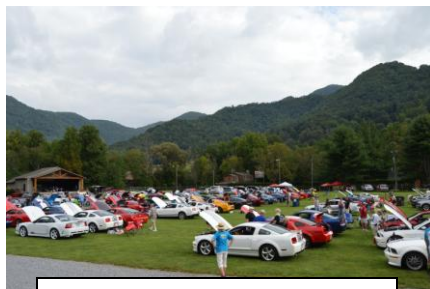
Saturday Show Field