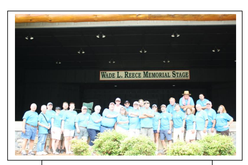
NEGMC Crew after the Awards