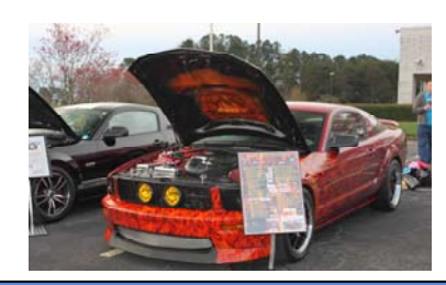
2006 Mustang GT