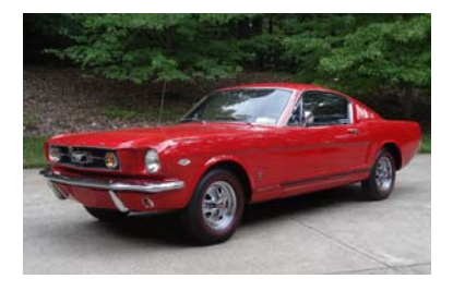
1965 Mustang GT Fastback